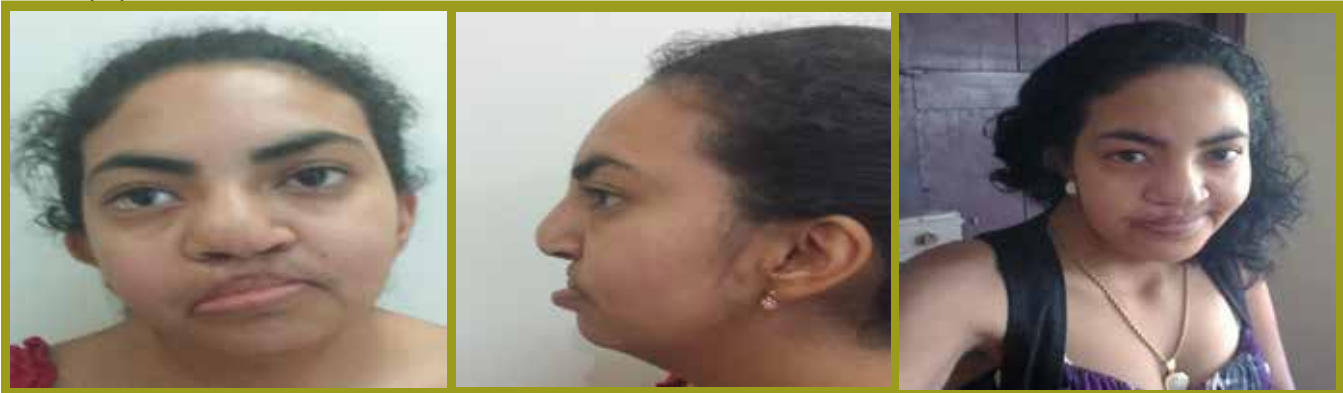
Before and after surgeons re-aligned her jaws and repositioned her chin

With your donations, Globus Relief is able to provide surgical teams like MPO USA, and many others, with instruments, supplies & equipment.